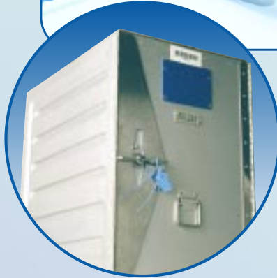
Ring-Pull Seal installed on aircraft liquor cabinet

DESIGNED EXCLUSIVELY FOR THE AIRLINE INDUSTRY