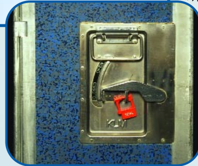
Spring-Air Seal installed on aircraft food cart

DESIGNED EXCLUSIVELY FOR THE AIRLINE INDUSTRY