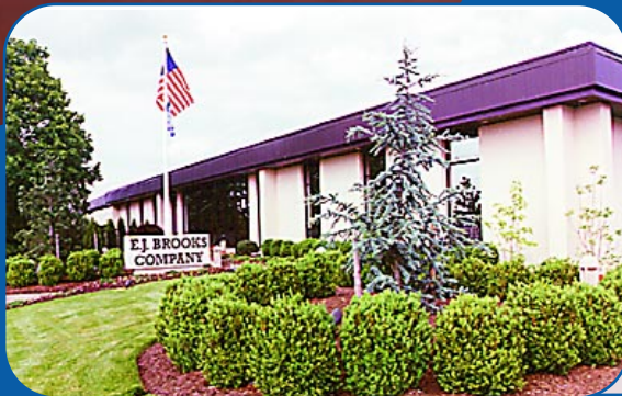
E.J. Brooks Company World Headquarters in Livingston, New Jersey, U.S.A.